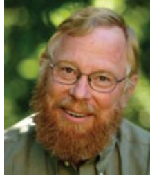
Ken Garrett, National Geographic photographer, will judge the contest

Quarterly newsletter published by the Clarke County Conservation Easement Authority dedicated to preserving properties with natural, cultural or scenic resources worthy of protection