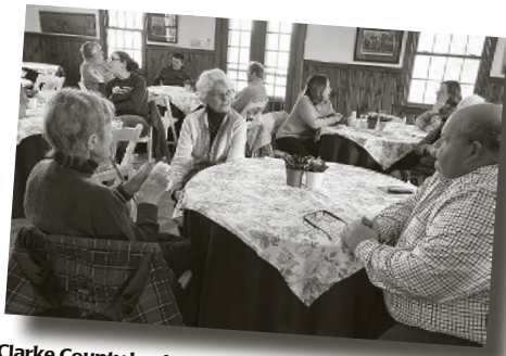
Clarke County leaders gathered for the Land Conservation Award luncheon in January

The Clarke County Conservation Easement Authority established the Wingate Mackay-Smith Land Conservation Award nine years ago.